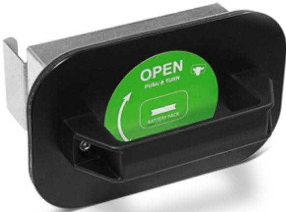
Extractable rechargeable battery.