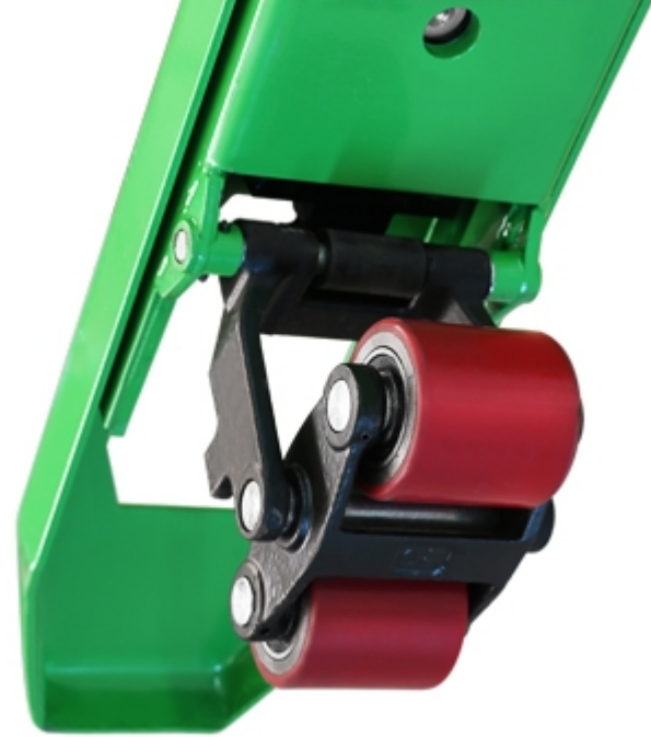
Closed Forks underside, for a higher protection against dirt.