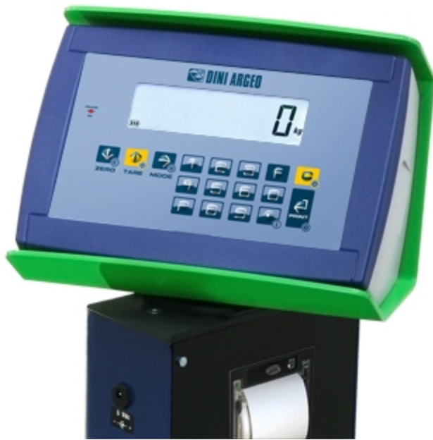
Swivelling head +/-160°.